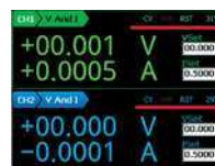
Voltage/ Current setting and Temperature Display