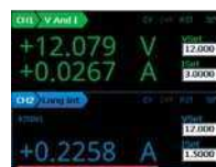
Long Integration Measurement