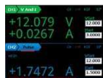
Pulse Current Measurement